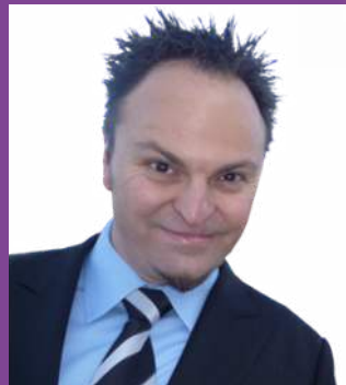
Steven Bradbury OAM